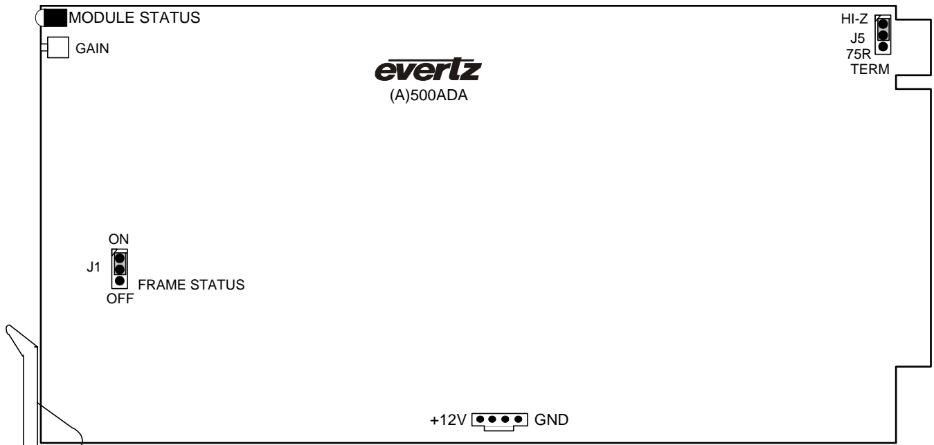
Figure 5-1: LED and Jumper Locations