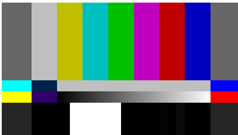
SMPTE color bar test pattern, 16:9 aspect ratio.