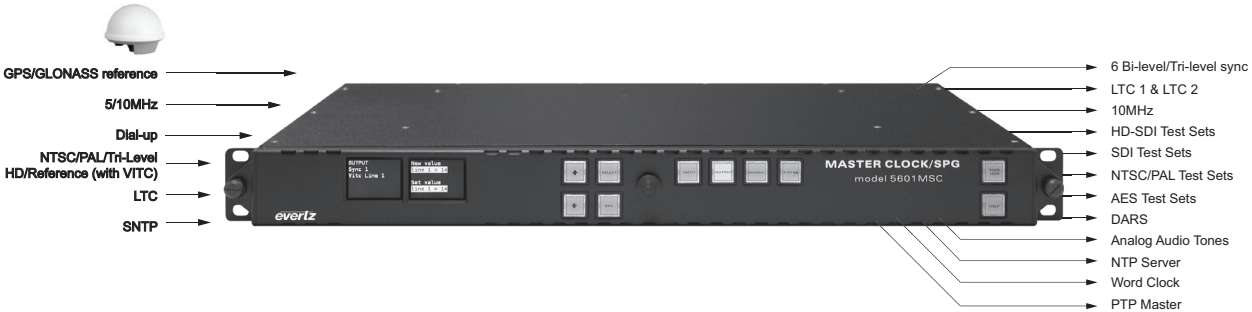
5601MSC Signal Inputs / Outputs